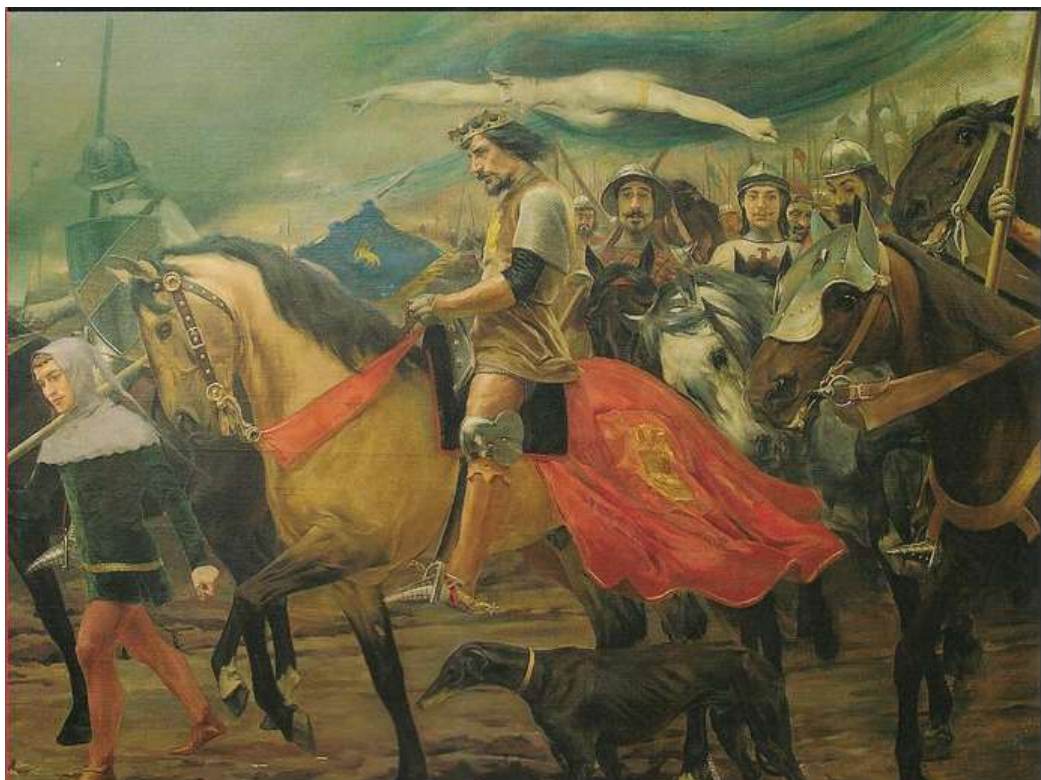
» John I of Castile, lifting the siege in Lisbon.

The death of the King D. Fernando in 1385 brought an instability period to the kingdom of Portugal. In the absence of a son, the leadership of the kingdom is assumed by the widow D. Leonor Teles de Menezes but in the name of her daughter D. Beatriz Teles and of her son in law D. João I of Castile. Aiming the peace between the two kingdoms, the marriage between these it was an arrangement that was settled on the Treated Salvaterra de Magos, signed by both kings D. Fernando of Portugal and D. João I of Castile.