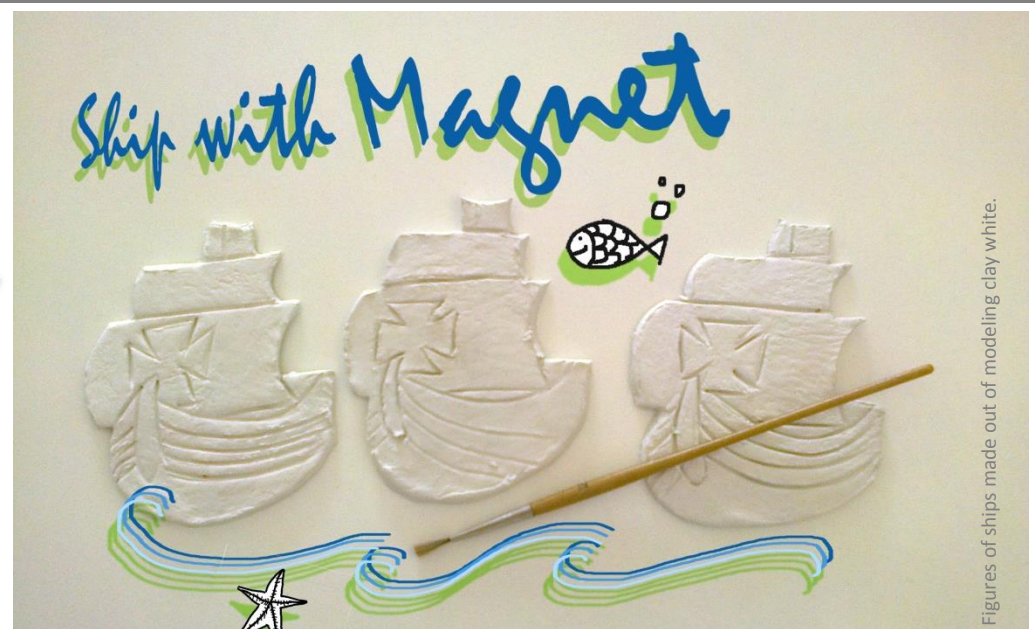
Figures of ships made out of modeling clay white.

LISBOA STORY CENTRE - Terreiro do Paço, n.º 78 a 81, 1100-148 LISBOA